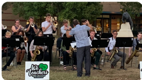
DHS Jazz Band